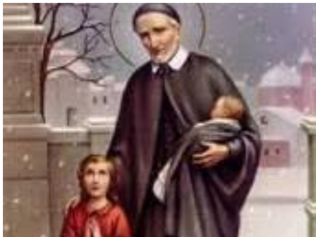
St. Vincent de Paul and the children