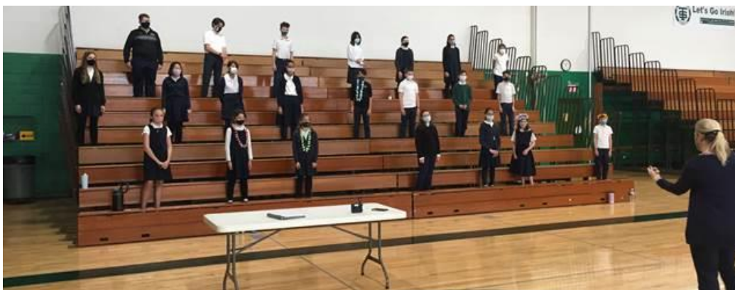
The upper school choir is reunited in the gym and begins practice on a piece to be produced in conjunction with the University of Michigan's Music Department.