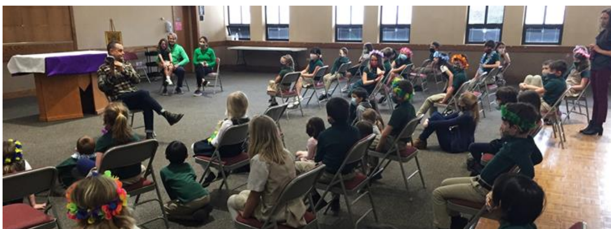
March is Reading Month Guest Reader, Dave Coulier , has fun reading 'Fair is Fair' and 'Stories of Curious George' to our lower school students.